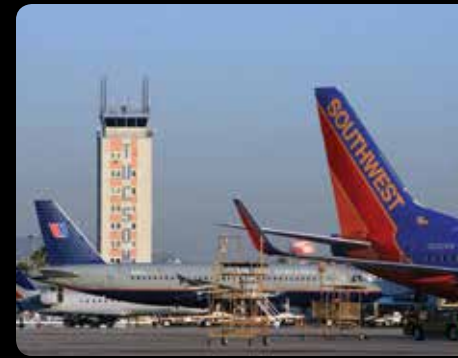
Tucson International has 3 active runways, the longest of which is over 11,000 feet. It has full 24-hour port of entry facilities for both cargo and passengers, including customs and immigration services.