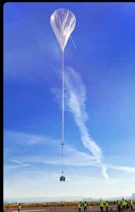
World View is the first tenant of ARC. The company uses high-altitude balloons to lift a variety of payloads to the stratosphere. The balloons will launch from Spaceport Tucson.