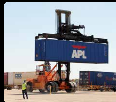
The Port of Tucson is the largest intermodal center in Arizona and highlights the area's flexibility in transportation. Rail, air, or truck services are available in a conveniently concentrated area.

Since 2009, One-Stop has worked with three other counties, area logistics companies in the Southern Arizona Logistics Education Organization and area colleges and universities to establish a regional logistics education program that resulted in 600 logistics-career credentials awarded.