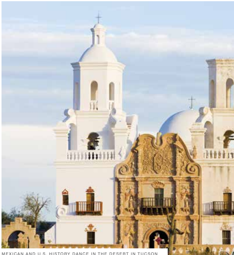
MEXICAN AND U.S. HISTORY DANCE IN THE DESERT IN TUCSON

Urban innovation that taps its outdoor bounty by increasing access to it is not a hard sell for a town where almost 25% are aged 20 and 34. Emboldened city leaders have been swinging for the fences, first by telling the world that Tucson is "The Winter Training Capital of America," made possible by the area's five mountain ranges long used as Stairmasters by cyclists and triathletes in the know.