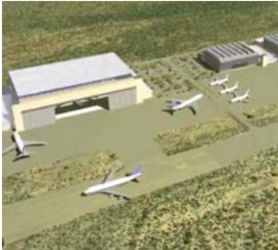
SITE A & B CONCEPT