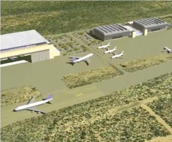
SITE A & B CONCEPT