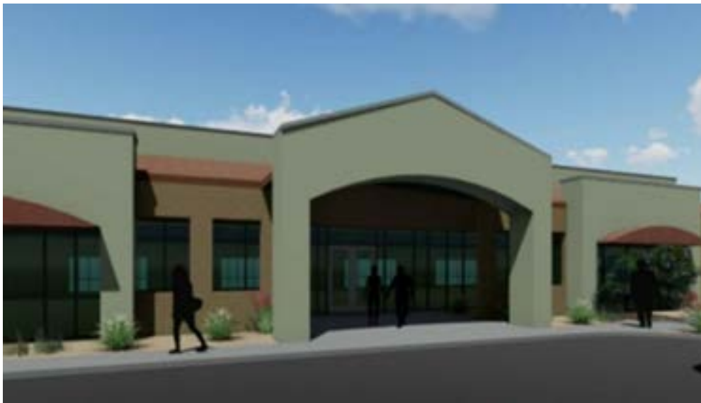
Parcel 2 Building Rendering