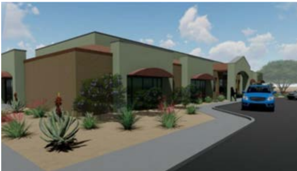
Parcel 2 Building Rendering