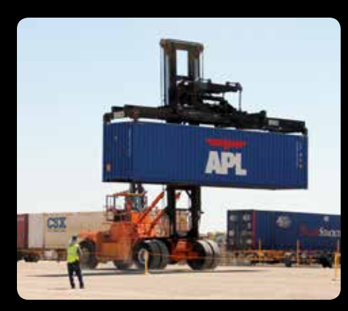
The Port of Tucson is the largest intermodal center in Arizona and highlights the area's flexibility in transportation. Rail, air, or truck services are available in a conveniently concentrated area.

Since 2009, One-Stop has worked with three other counties, area logistics companies in the Southern Arizona Logistics Education Organization and area colleges and universities to establish a regional logistics education program that resulted in 600 logistics-career credentials awarded.