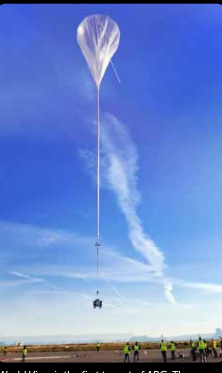
World View is the first tenant of ARC. The company uses high-altitude balloons to lift a variety of payloads to the stratosphere. The balloons will launch from Spaceport Tucson.