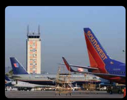
Tucson International has 3 active runways, the longest of which is over 11,000 feet. It has full 24-hour port of entry facilities for both cargo and passengers, including customs and immigration services.